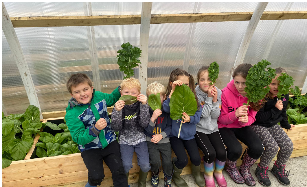
The Hebridean Community Garden updates - page 3