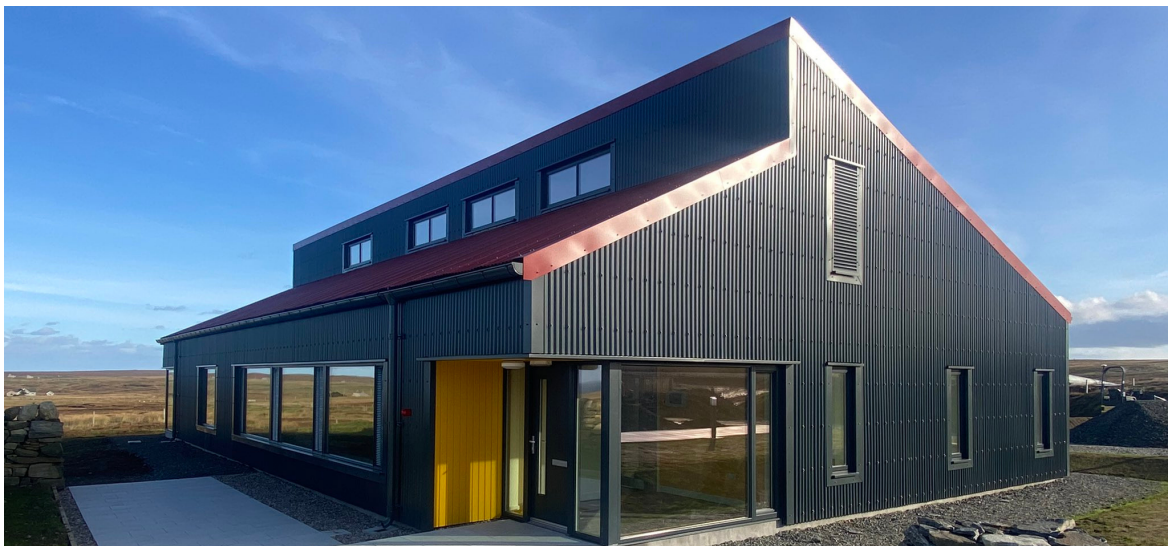
Our new business centre in South Galson.