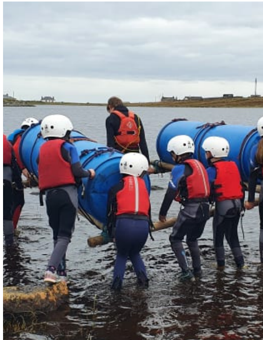
October Plòigh - page 5