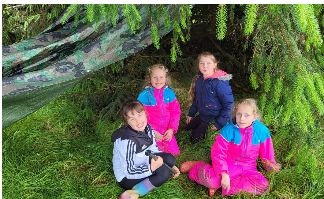
Summer Plòigh - Page 4