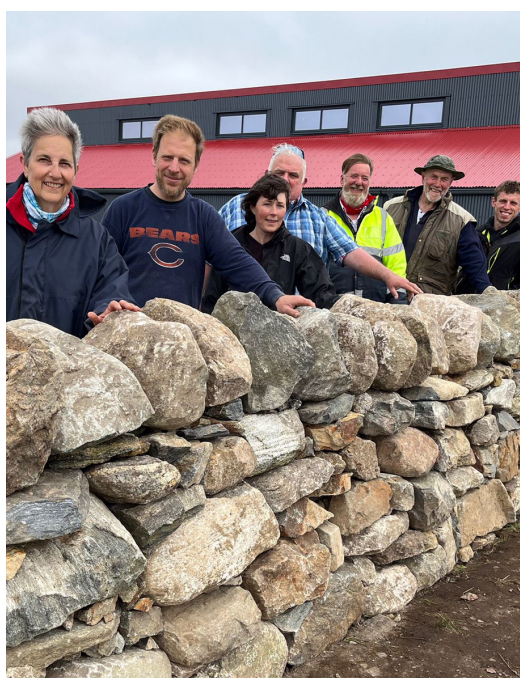
Drystone Walling Course - Page 7