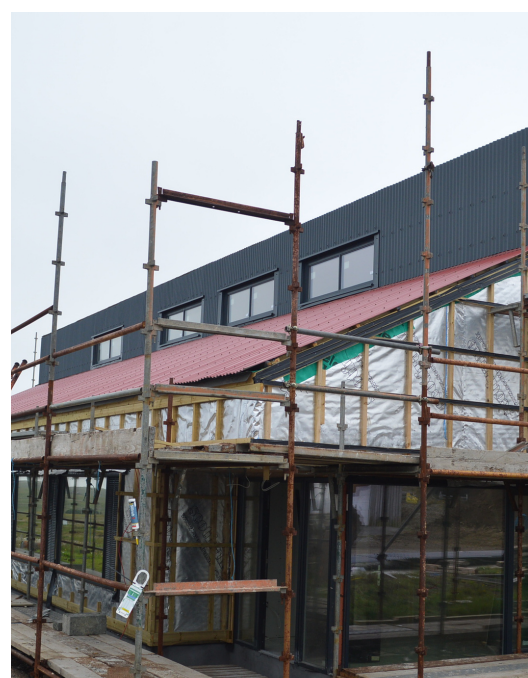
New business centre - page 4