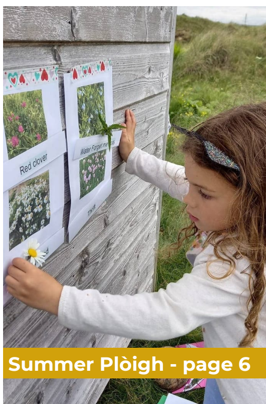
Summer Plòigh - page 6

Information about our Community Land Scotland artist in residence project - page 7