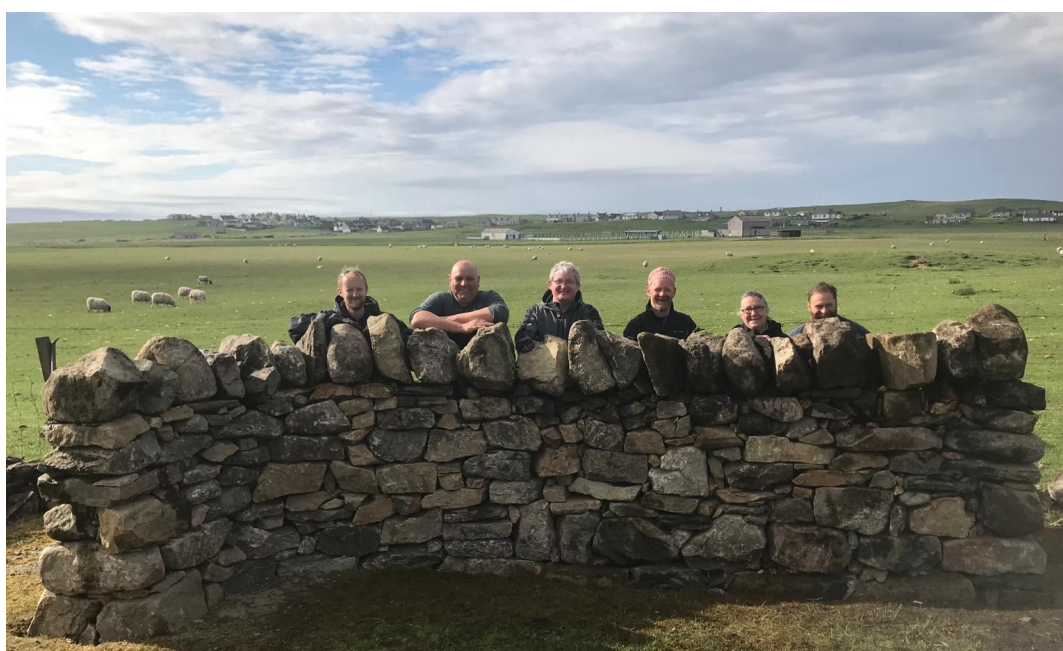
Drystone Walling Courses - page 5