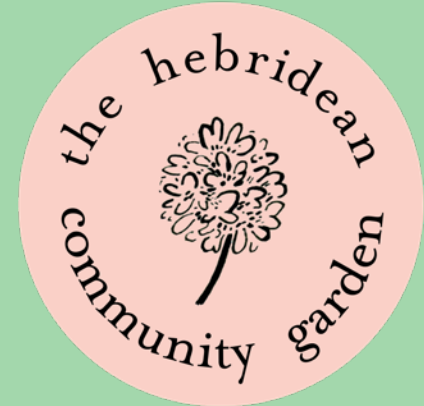
Find us on instagram and facebook!

We very much look forward to sharing this with you all in the coming year.