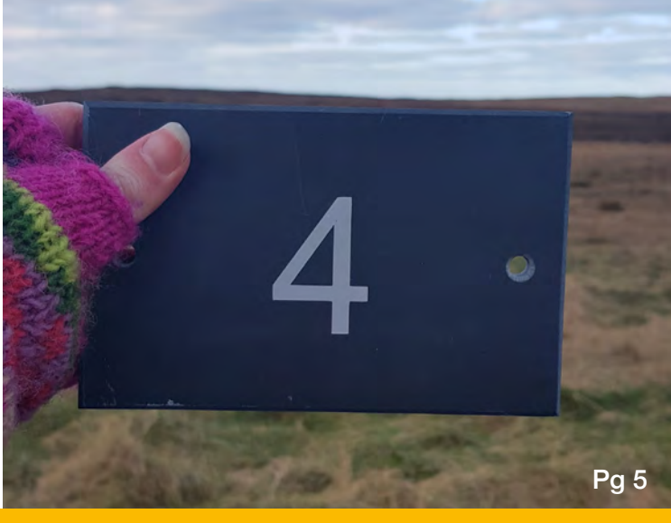
HOUSE NUMBERING PROJECT