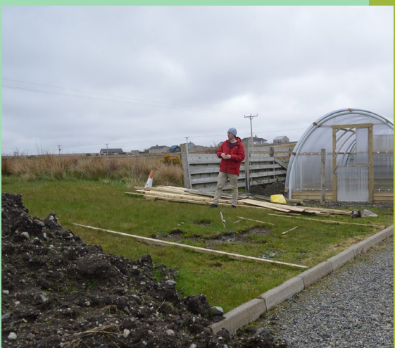
Find us on instagram and facebook @HebrideanCommunityGarden