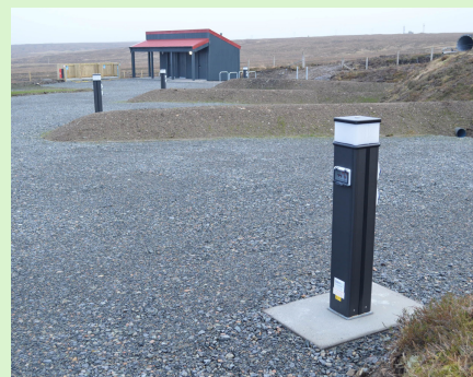
First guest at the Galson Campsite, top. Electric hook-up points, below.