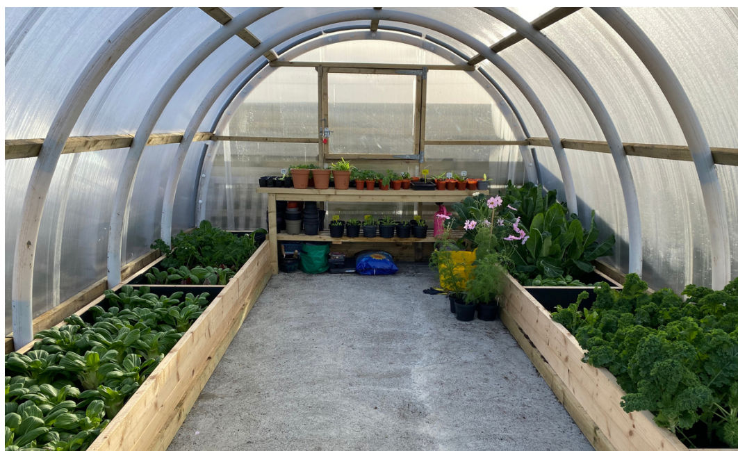
The Hebridean Community Garden Updates - Page 5