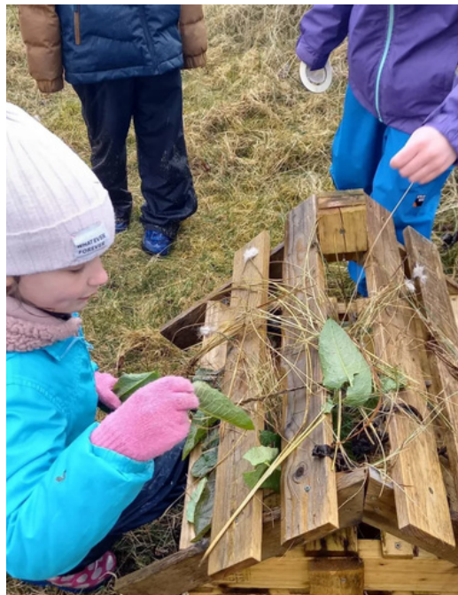
Plòigh & Plòigh Mhòr - Page 5